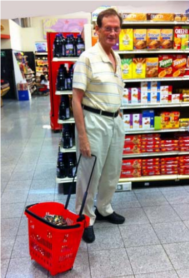
25 ron shopping for turkey in costa rica