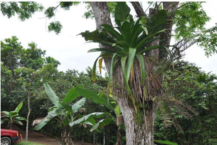
15 Giant Bromelaid