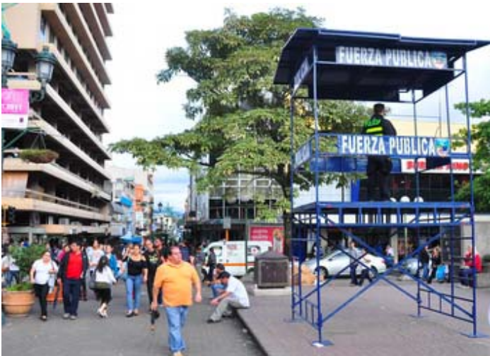
27 police stand in san jose CR