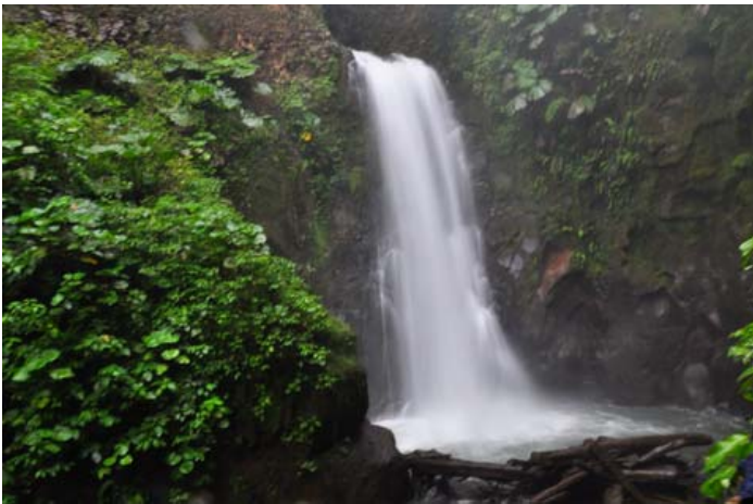
03 Temple water falls costa rica