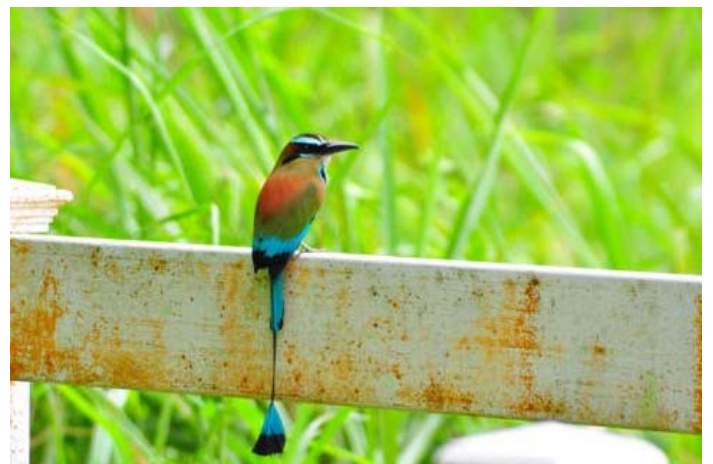
13 Turquoise browed Motmot - a CR native