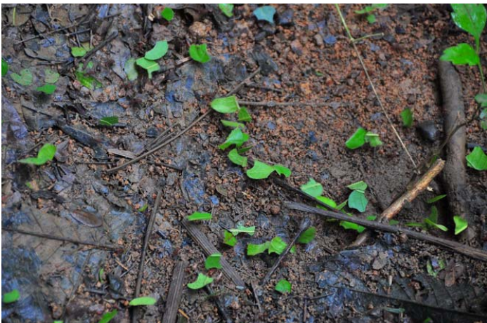
23 Leaf-cutter Ants