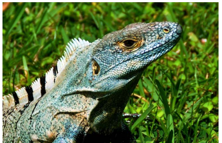
18 iguana costa rica