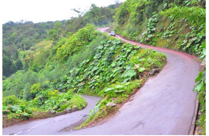
20 Winding road up mountain