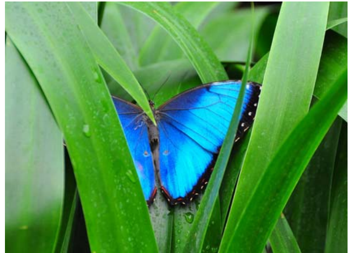
08 Morpho butterfly