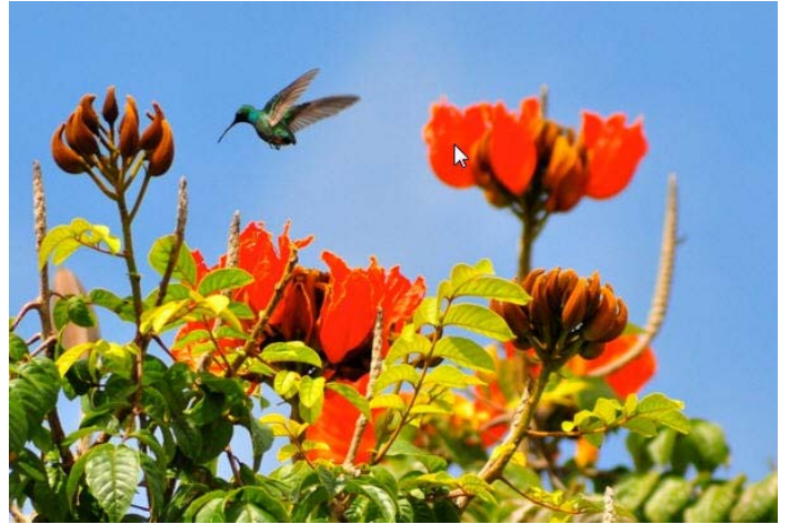
15 Nancy s hummingbird on poro tree