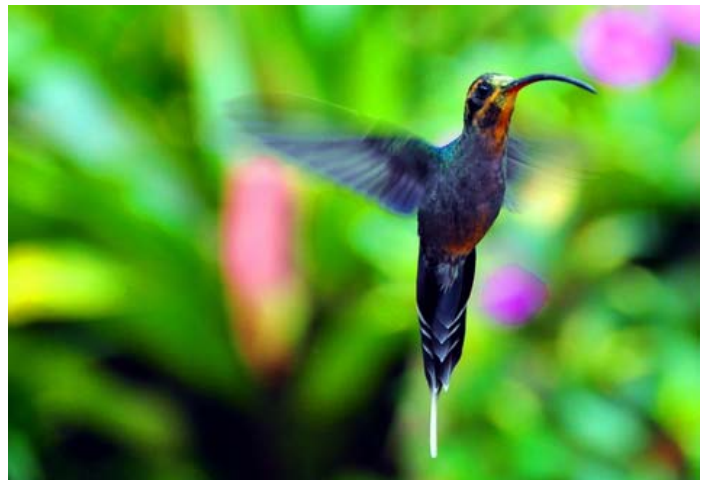
16 Sabre-wing hummingbird