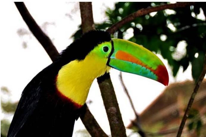
17 Friendly Toucan