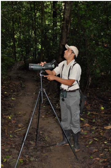
21 Bird Watching Guide