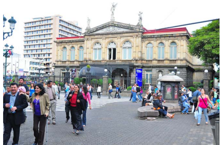
28 National Theatre on Black Friday