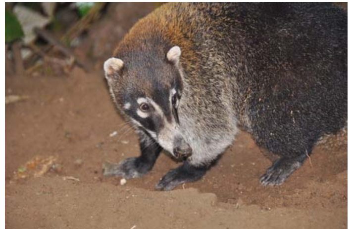
04 White-nosed Coati