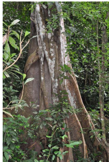
24 Tree suffocating another tree