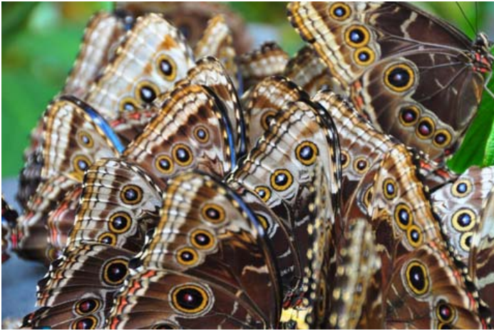
07 morpho butterflies folded wings