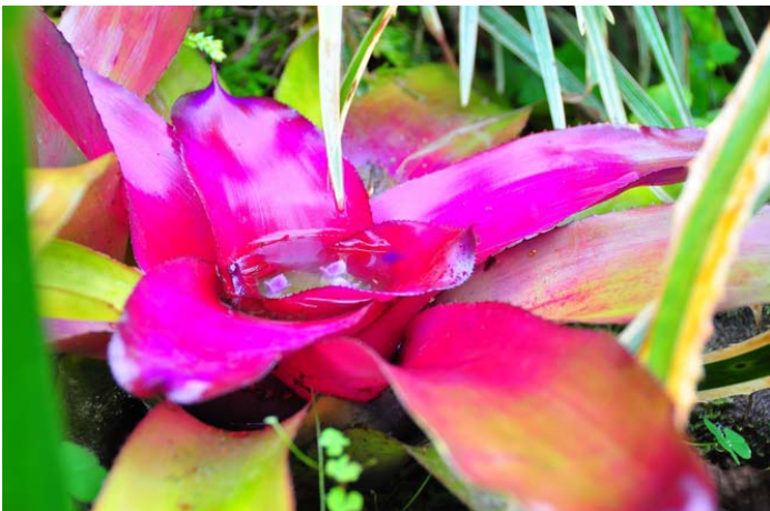
05 water-catching bromeliad with tadpoles