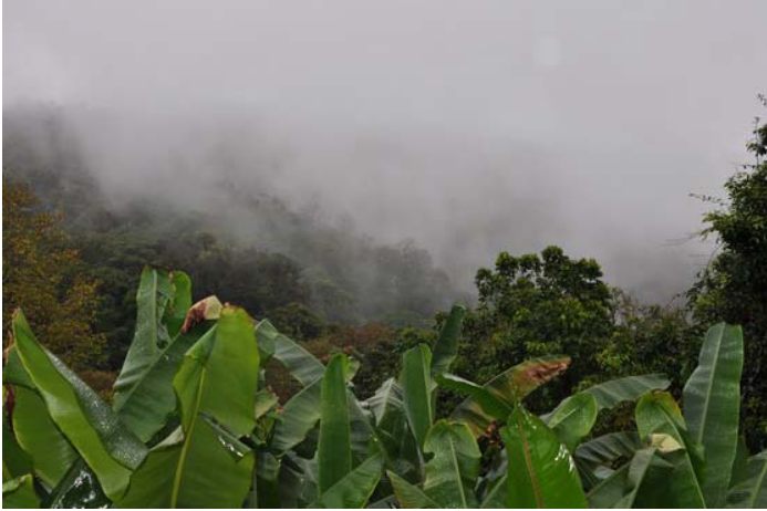
01 Clouds in Rainforest