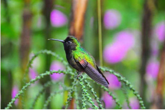
14 Costa Rican Hummingbird