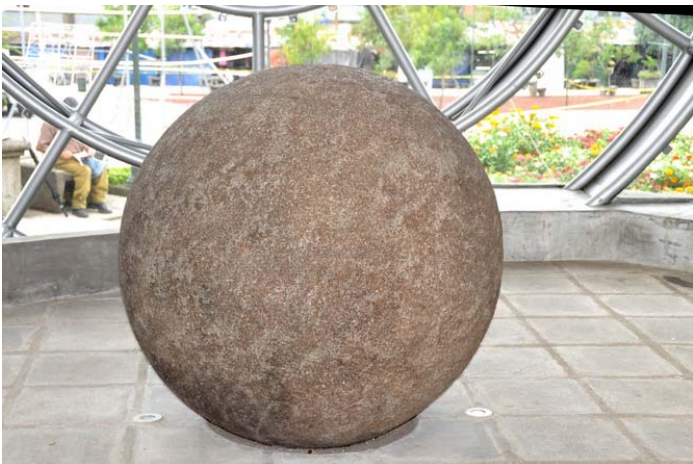
29 4-ft Mysterious Sone Sphere