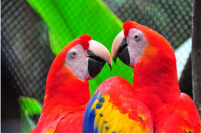
19 Caring Mccaws