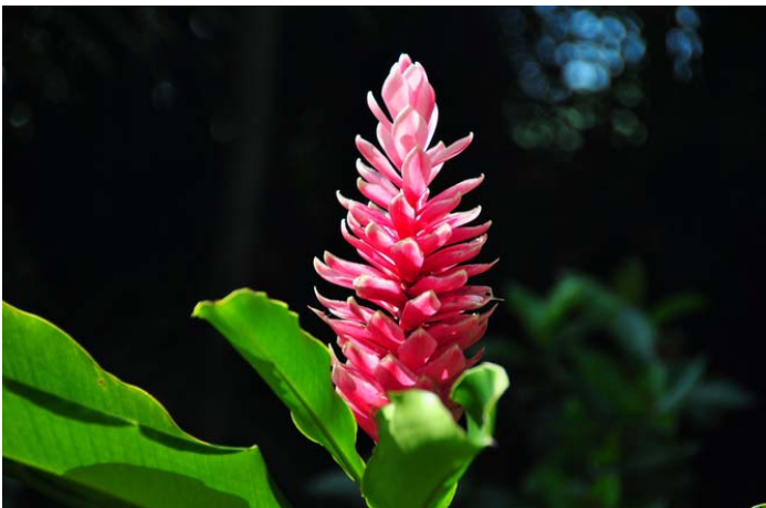
11 Red Ginger