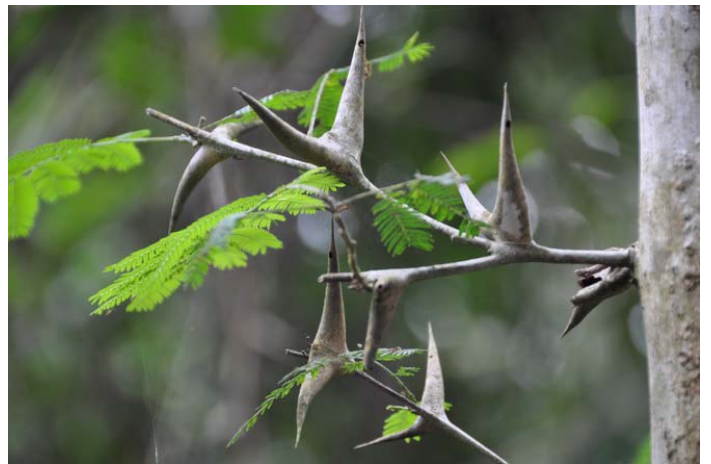
22 Pods of Tree-Protector Ants